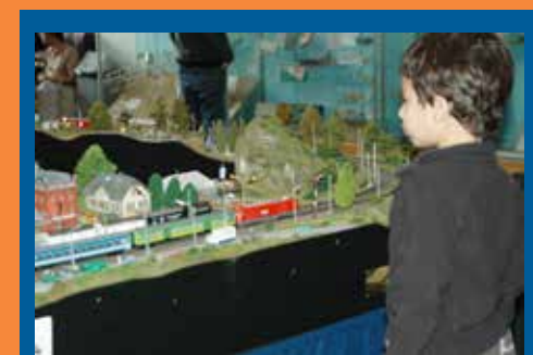
SPRING MODEL TRAIN SHOW MARCH 30 – APRIL 7