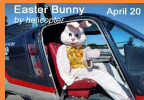
Easter Bunny by helicopter April 20