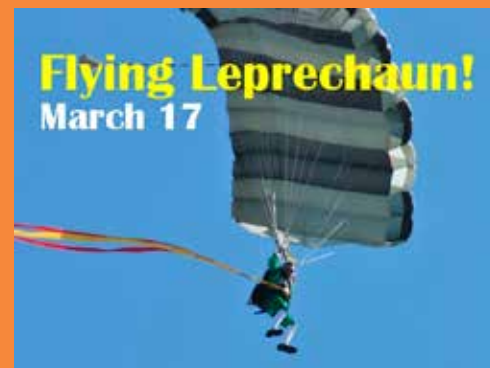
Flying Leprechaun! March 17

The success of the 707 emboldened Juan Trippe, Pan Am's president, to push Boeing for development of an even larger jetliner. Boeing had participated in an Air Force competition in 1963 to build a large military airlifter. While Boeing lost the competition to Lockheed's C-5, the effort created the