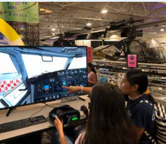
Girls' Aero Team and Hiller Museum flight simulators.

Commercial aviation grew tremendously after World War II. Pilot recruitment was not a serious challenge at first as military flight training programs had produced hundreds of thousands of skilled pilots and released them into civilian life. Many were happy to seize an opportunity to continue their piloting careers in peacetime. By the 1990s, however, the nature of pilot training had changed dramatically. Deregulation of the US airline industry caused demand for airline service to triple between 1975 and 2010. Concurrently, the end of the Cold War in the late 1980s significantly reduced the number of pilots being discharged from the military. Airlines increasingly sought to recruit new pilots from civilian flight training programs to fill out their ranks.