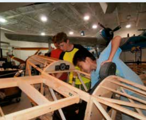
Penguin Airplane With Students at Hiller Aviation Museum

In 1929 Edward Link transformed flight training with the first flight simulation device. Repurposing technology used in his parents' organ company, Link developed a simulator known as the Link Trainer. The student sat within an enclosed cockpit that was moved by pneumatic bel-