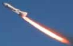
SpaceShipOne igniting its rocket engine

One of the speakers at the announcement of the X-Prize was an eccentric aircraft designer named Burt Rutan. Rutan had worked with the United States Air Force as a civilian engineer at Edwards Air Force Base, then designed and built kits for personal aircraft before establishing Scaled Composites at Mojave Airport in 1982. He led the design and construction of a range of innovative aircraft, including the Voyager aircraft which completed the first nonstop, unrefueled flight around the world in 1986. Rutan had long advocated a larger role for private industry in the development of flight, and was intrigued by Diamandis' idea of a prize to spur new advances in space transportation.