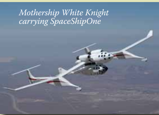
Mothership White Knight carrying SpaceShipOne

aviation and its potential for boosting newspaper sales, and knew that the year before a prize offered by the London-based Daily Mail inspired Louis Bleriot to fly across the English Channel. Hearst developed a prize of his own for a transcontinental flight across the United States. Although the deadline expired before the prize could be claimed, it motivated Cal Roberts' pioneering cross-country trip in the Wright Model B Vin Fiz in 1911.