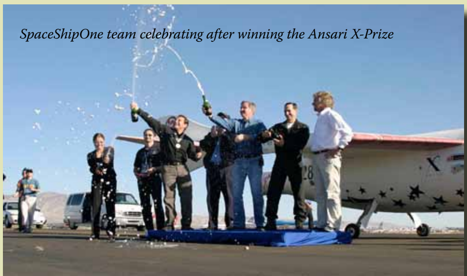
SpaceShipOne team celebrating after winning the Ansari X-Prize