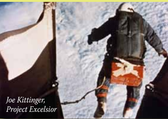
Joe Kittinger, Project Excelsior

In 1958 the United States Air Force launched Project Excelsior. The mission plan for Project Excelsior was outwardly quite simple: launch a helium-filled balloon to extreme altitude, and have the pilot within exit by parachute. Parachutes had been used since the 1780s, but a jump from 100,000' or more is daunting. At altitudes above 60,000', air pressure drops to a point at which water boils at human body temperature. Depressurization results in unconsciousness in seconds, and death in minutes. The pilot for Project Excelsior was Air Force Captain Joseph Kittinger. Kittinger traveled to altitude in an unpresurized balloon gondola, wearing a pressure suit and multiple layers of insulating clothing. The first jump, from 75,000', took