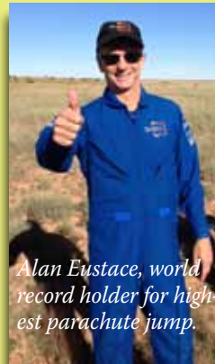
Alan Eustace, world record holder for highest parachute jump.

http://www.worldview.space/voyage/ , downloaded 2 February 2017