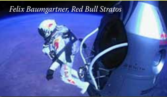
Felix Baumgartner, Red Bull Stratos